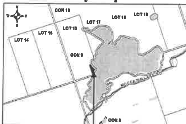
Location of Amendment